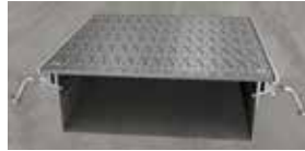
ACD Diamond Plate CAST-IN/BLOCKOUT 4-36" | ($ by unit) 1/4", 3/8", 1/2" plate thicknesses Liner optional