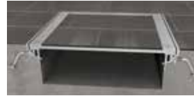
ACT Tile Recessed Plate CAST-IN/BLOCKOUT 4-36" | ($ by unit) 1/4", 3/8", 1/2" plate thicknesses Liner optional