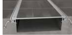
TST Tile Recessed Plate CAST-IN/BLOCKOUT 4-36" | ($ by linear foot) 1/4", 3/8", 1/2" plate thicknesses Liner optional