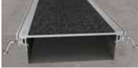
TSA Abrasive Infill CAST-IN/BLOCKOUT 4-36" | ($ by linear foot) 1/4", 3/8", 1/2" plate thicknesses Liner optional