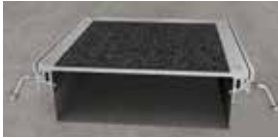
ACA Abrasive Infill CAST-IN/BLOCKOUT 4-36" | ($ by unit) 1/4", 3/8", 1/2" plate thicknesses Liner optional