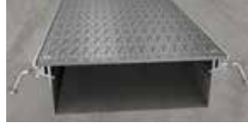
TSD Diamond Plate CAST-IN/BLOCKOUT 4-36" | ($ by linear foot) 1/4", 3/8", 1/2" plate thicknesses Liner optional