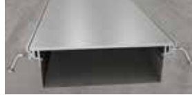
TSP Smooth Plate CAST-IN/BLOCKOUT 4-36" | ($ by linear foot) 1/4", 3/8", 1/2" plate thicknesses Liner optional